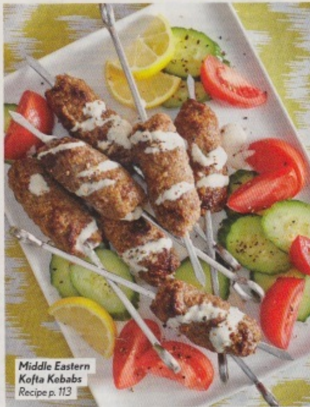
Middle Eastern Kofta Kebabs Recipe p. 113