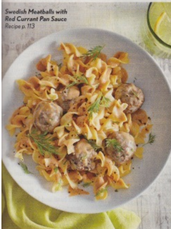
Swedish Meatballs with Red Currant Pan Sauce Recipe p. 113