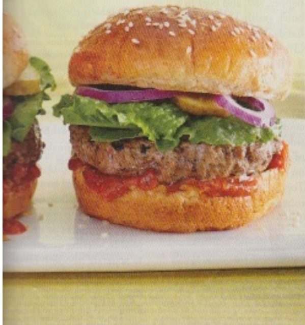
Bloody Mary Burgers Recipe p. 112